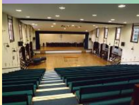
Oaklands School Hall

This season's concerts include some particularly famous works and popular local soloists but also some interesting works which are new to the orchestras.