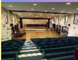
Oaklands School Hall

Both orchestras have a solid reputation for high quality performances with outstanding soloists, including familiar local musicians, up-and-coming new talent and established international performers.