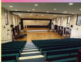
Oaklands School Hall

Both orchestras have a solid reputation for high quality performances with outstanding soloists, including familiar local musicians, up-and-coming new talent and established international performers.